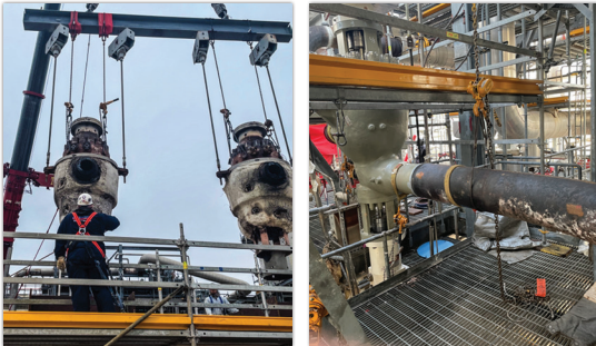
Main Steam Control Valve Removal & Install