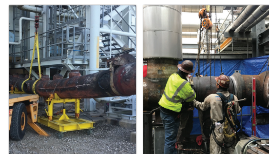
Rigging & Install

CUST-O-FAB can fabricate piping systems to any of following codes: