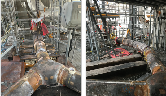
High Pressure Steam Wye Block Piping