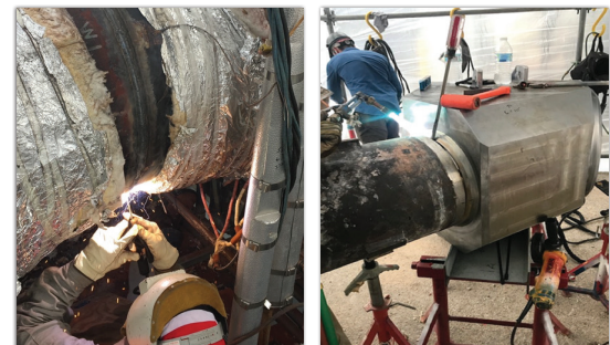
High Energy Piping